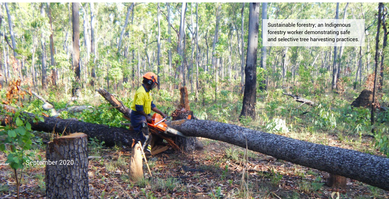
Sustainable forestry; an Indigenous forestry worker demonstrating safe and selective tree harvesting practices.